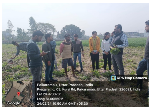
Empowering Paikramau Farmers with Radish Cultivation Techniques, it's Harvesting and Marketing.