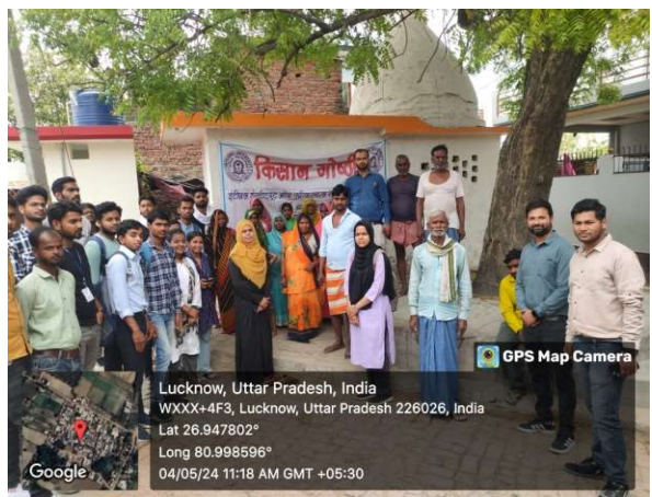
Kisan goshti in Basha village on Sustainable Farming: Nurturing our Land, Livestock and Livelihoods