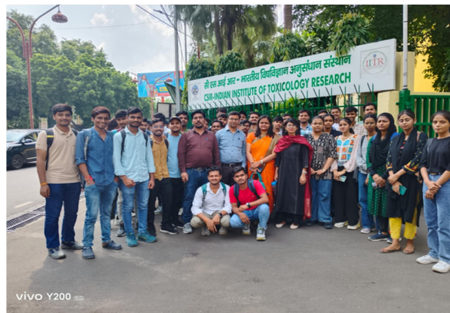
Educational Visit of Under Graduate Students of Department of Agriculture, IAST to Indian Institute of Toxicology Research (IITR), Lucknow