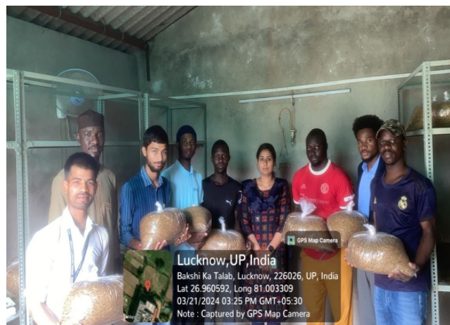
Students of Department of Agriculture, IAST, actively engaged in Mushroom Production under Experiential Learning Program