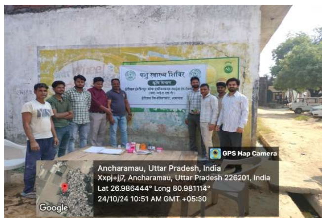
Organized Animal Health Camp in Achramau Village