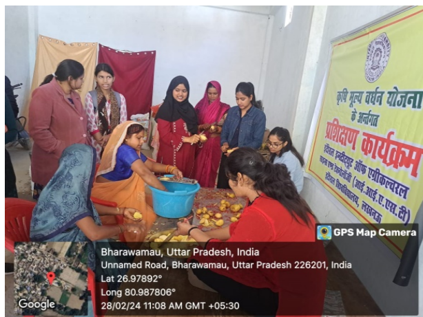
Training Program on Krishi Mulya Vardhan Yojna in Bhagatpurwa Village on “Value Addition and Marketing Opportunities of Potato for Farm Women”