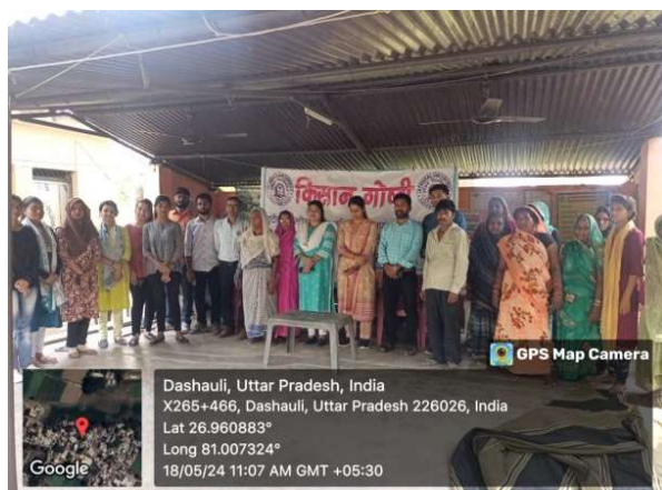
Kisan Goshti in Dasauli Village on Integrated Disease management in Crops