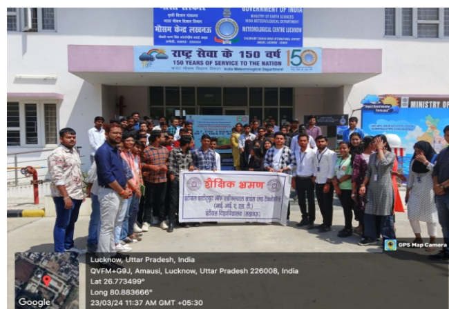
Educational Visit of Under Graduate Students of Department of Agriculture, IAST, to the Regional Meteorological Center, Amausi Airport, Lucknow on World Meteorological Day